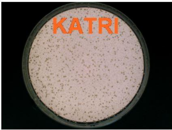
[ 대조편(Control sample), After 18h ]