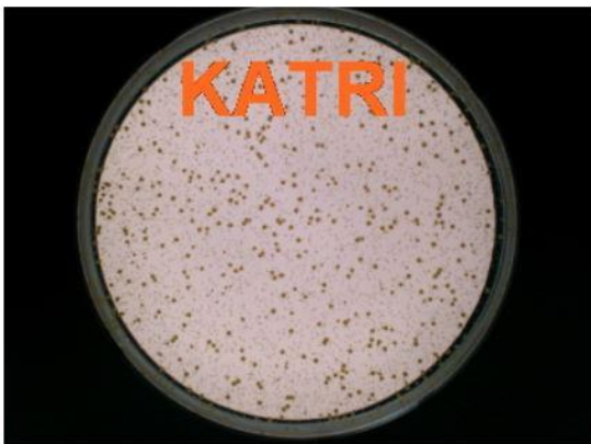
[ 대조편(Control sample), After 18h ]