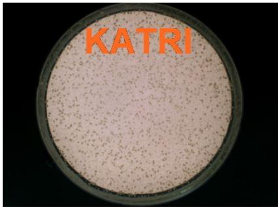
[ 대조편(Control sample), After 18h ]