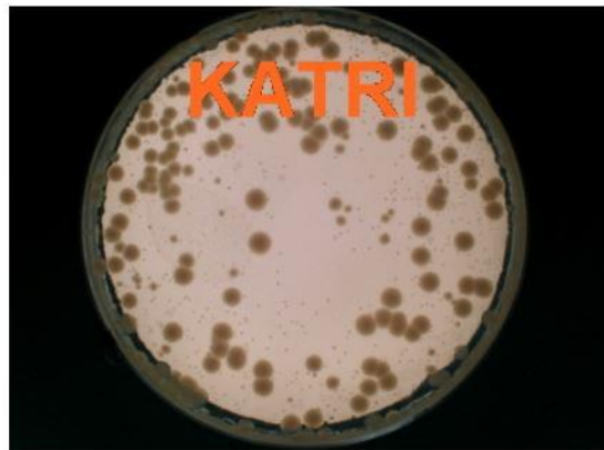
[ 시험편(Test sample), After 18h / S#1 ]