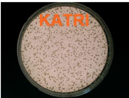
[ 대조편(Control sample), After 18h ]