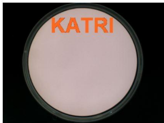
[ 시험편(Test sample), After 18h / S#1 ]