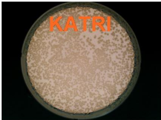
[ 대조편(Control sample), After 18h ]