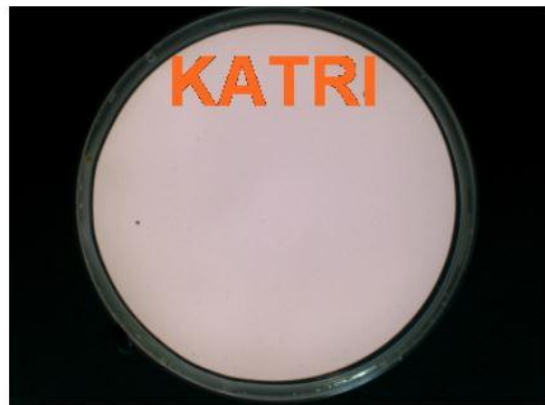
[ 시험편(Test sample), After 18h / S#1 ]