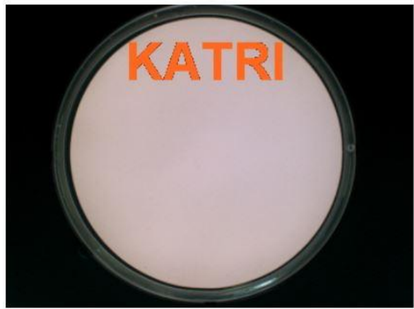
[ 시험편(Test sample), After 18h / S#1 ]